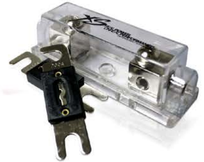
Fuse/Holder ANL, 1/0 to 4AWG, Fuse Holder - Silver Finish and Clear Cover. 150A, 200A, 250A, 300A and 350A Fuses Available