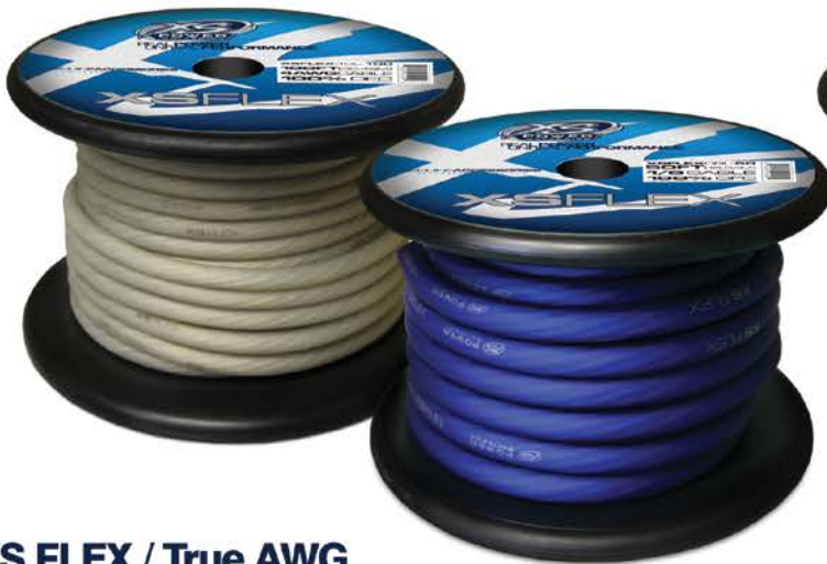
XS FLEX / True AWG 100% Pure Oxygen Free Tinned Copper

BLUE0AWG (XSFLX0BL-50), CLEAR0AWG (XSFLX0CL-50), BLACK0AWG (XSFLX0BK-50) RED0AWG (XSFLX0RD-50), BLUE4AWG (XSFLX4BL-100), CLEAR4AWG (XSFLX4CL-100) BLACK4AWG (XSFLX4BK-100), RED4AWG (XSFLX4RD-100), BLUE8AWG (XSFLX8BL-250) CLEAR8AWG (XSFLX8CL-250), BLACK8AWG (XSFLX8BK-250), RED8AWG (XSFLX8RD-250)