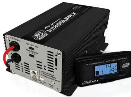
PSC IntelliSUPPLY *15A, 30A and 60A Models Available 12V, 14V and 16V Compact High Frequency IntelliSUPPLY with AGM charge mode. 15A, 30A and 60A Models Available