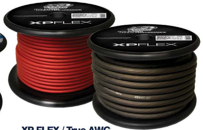
XP FLEX / True AWG

BLUE0AWG (XSFLX0BL-50), CLEAR0AWG (XSFLX0CL-50), BLACK0AWG (XSFLX0BK-50) RED0AWG (XSFLX0RD-50), BLUE4AWG (XSFLX4BL-100), CLEAR4AWG (XSFLX4CL-100) BLACK4AWG (XSFLX4BK-100), RED4AWG (XSFLX4RD-100), BLUE8AWG (XSFLX8BL-250) CLEAR8AWG (XSFLX8CL-250), BLACK8AWG (XSFLX8BK-250), RED8AWG (XSFLX8RD-250)