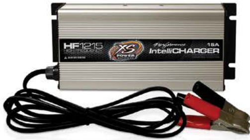
HF1215 *240V models available upon request Compact High Frequency AGM IntelliChargers 15AMP Max Output. 12V, 14V and 16V Models Available