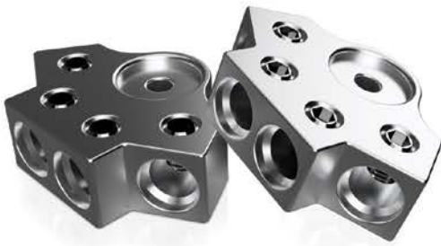
TB-604v2 600 Series Aluminum Terminal Blocks, 1/0, 4 Spots, M6/M8 Bolts. 2, 6, 8 Spot Designs In Copper And Aluminum Are Available.