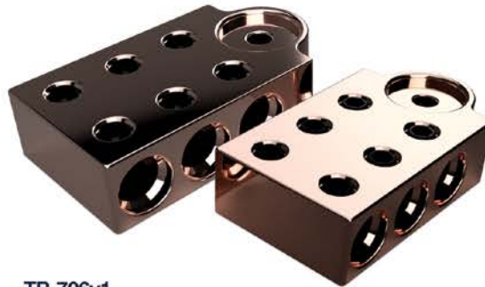
TB-706v1 700 Series Copper Terminal Blocks, 1/0, 4 Spots, M6/M8 Bolts. 2, 6, 8 Spot Designs In Copper And Aluminum Are Available.