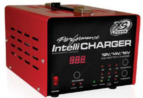
1005 *1005E model not shown, is 110V & 240V switchable 12V, 14V and 16V AGM IntelliCHARGER, Compatible 5A, 15A and 25A (25AMP Max Output), Three Charging Modes